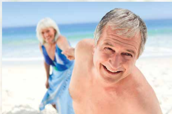
Protect your skin from the sun every day