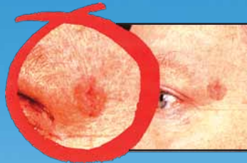
Basal Cell Carcinoma