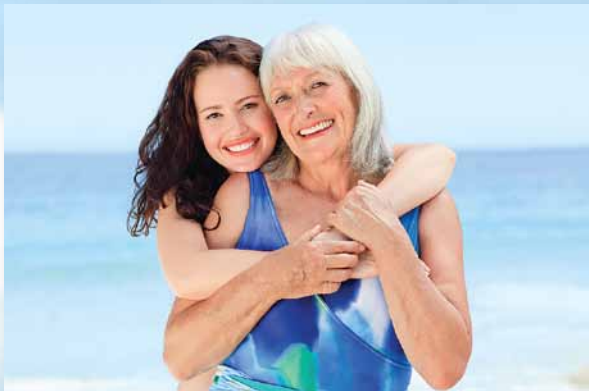
Skin cancer can effect women too

Prolonged exposure to the sun over time can cause skin cancer and melanoma in both men and women. As Queensland has one of the highest rates of skin cancer in the world it is absolutely vital that all of us protect our skin. The UV readings in the Bayside area are high all year round, so sun protection needs to be part of our daily routine. The older we become, the higher the risk of skin cancer developing on our face, hands, legs and back. Even those who protect their skin can still develop skin cancer in Queensland.